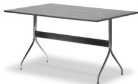
rectangular dining table