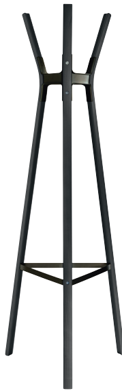
Finish Frame: Beech Painted Black Joints: Black 5140