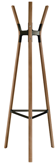
Finish Frame: American Walnut Joints: Black 5140