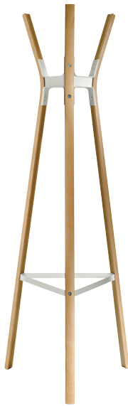
Finish Frame: Natural Beech Joints: White 5108