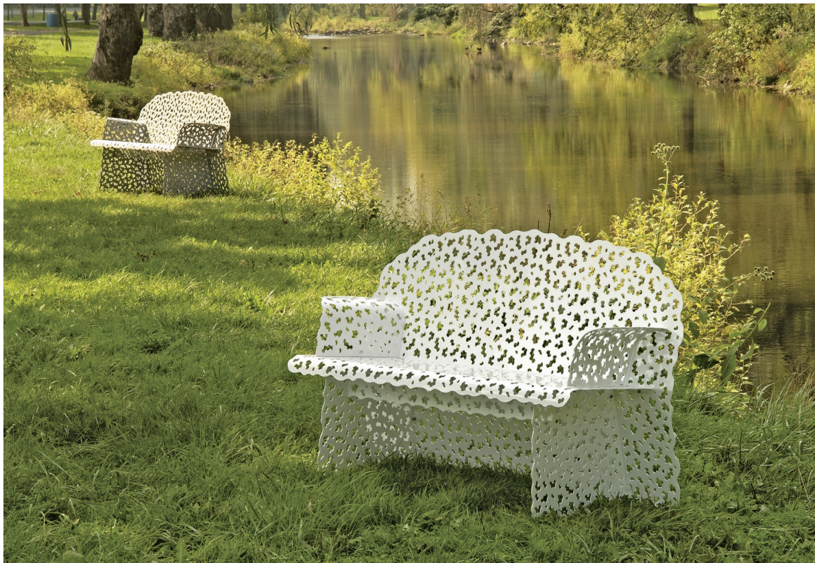
BKS-284

RICHARD SCHULTZ Trained as a Mechanical Engineer at Iowa State and later at the Institute of Design in Chicago, the innovative and esteemed outdoor furniture designer, Richard Schultz, joined the Knoll Planning Unit in 1951. Shortly thereafter he was sent to Pennsylvania, and began working closely with Harry Bertoia on a whole wire furniture collection. In 1960, the Petal table was introduced to accompany the Bertoia chairs and immediately became a part of the MoMA Design collection. Richard went on to create many designs while at Knoll, including the Leisure Collection (currently the 1966 Collection), which has won the International Design Award and has since been included in the permanent collections of many international museums.