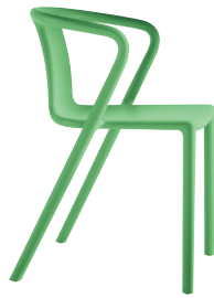
Matt colour Green 1320 C