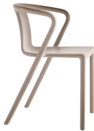
Matt colour Beige 1450 C