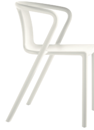
Matt colour White 1730 C