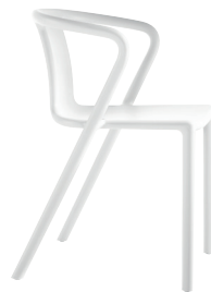
Matt colour Pure White 1690 C