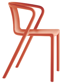
Matt colour Orange 1086 C