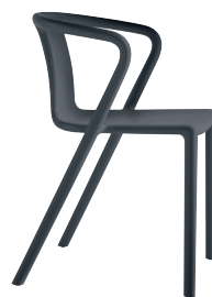
Matt colour Grey Anthracite 1418 C