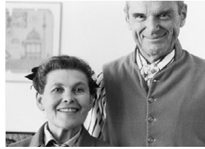
Designers: Charles and Ray Eames